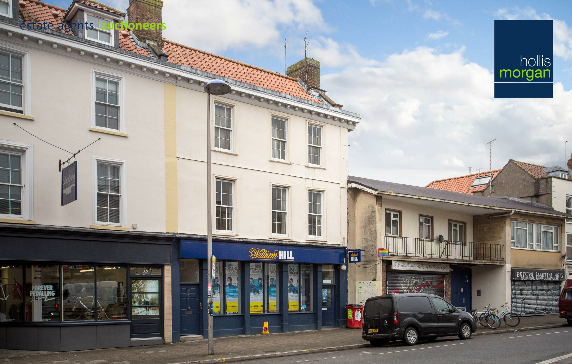
First Floor Rear, 33 Old Market Street, Old Market, Bristol, BS2 0HB